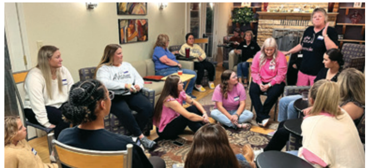
Teen Girls Programs

The Schliemann Center for Women's Health is a vital part of Baxter Health's effort to provide excellent healthcare education for all women, whatever her age or role in life. We are here to support all women in becoming confident and educated in the areas of their health and assist them in making positive changes toward wellness. Call (870) 508-2345.