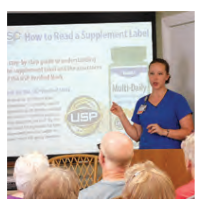
MFECOA Offers Numerous Classes