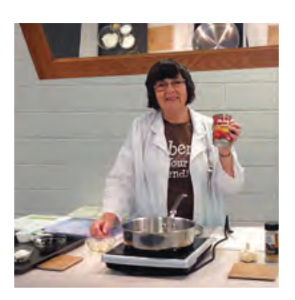
RDLC Diabetic Cooking Classes