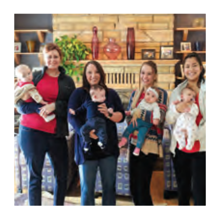
SCWHE Mommy & Me Classes