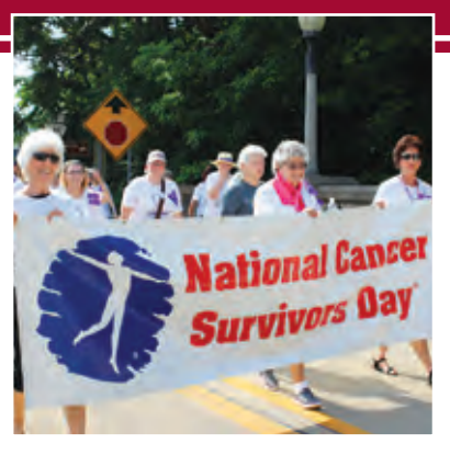
PCSH Celebrating Survivors!

The RDLC truly cares about the success of each and every diabetes patient. Please call 870-508-1765 for more info.