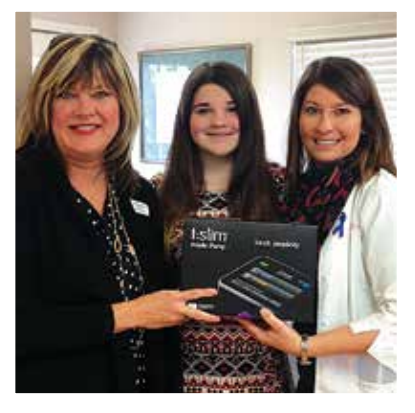
RDLC Offers New Solutions for Diabetics