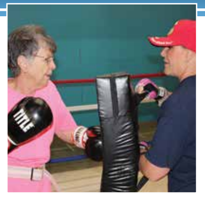
MFECOA Rock Steady Boxing

The Peitz Cancer Support House provides a complete support services program from first diagnosis throughout treatment and beyond in a comfortable home-like environment. All services are free of charge. For more information, please call 870-508-CARE (2273).