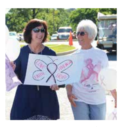
PCSH Supporting One Another