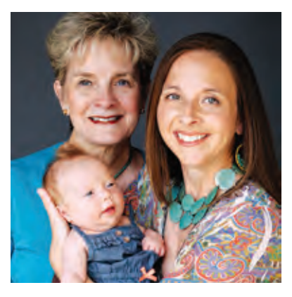
SCWHE - Supporting Women of All Ages