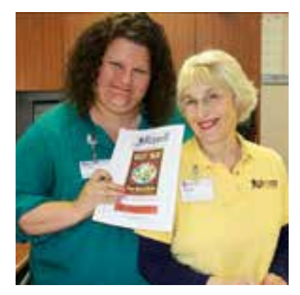
RDLC Teaches Healthy Eating