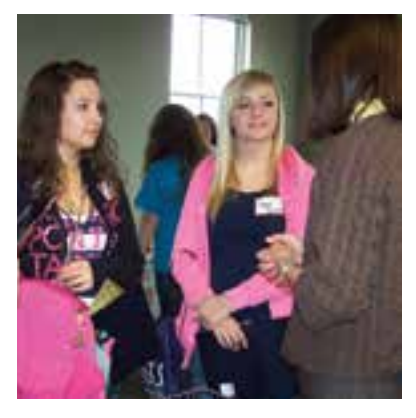
SCWHE Teen Girls Go To College