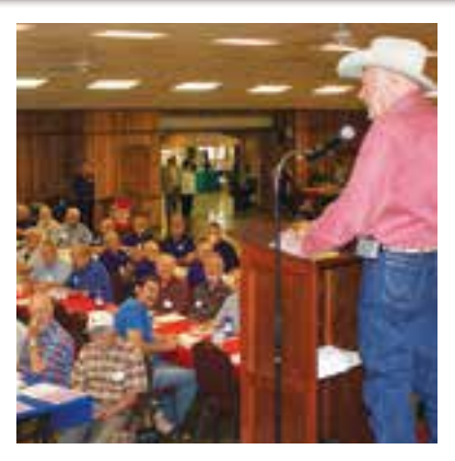
MFECOA Men's Health Forum

The PCSH is dedicated to doing everything they can to help those who have had cancer enter their lives. All services are provided free of charge. For more info, please call 870-508-CARE (2273).