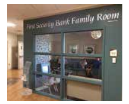
A gift from First Security Bank for the renovation of the First Security Bank Family Room

Renovation of the Women & Newborn Care Center doubled the nursery capacity to 10 Level 2 nursery beds, provided one-room care for mothers and babies to stay together throughout labor, delivery and recovery, advanced technology to improve care and safety in the nursery and enhanced patient education and support.