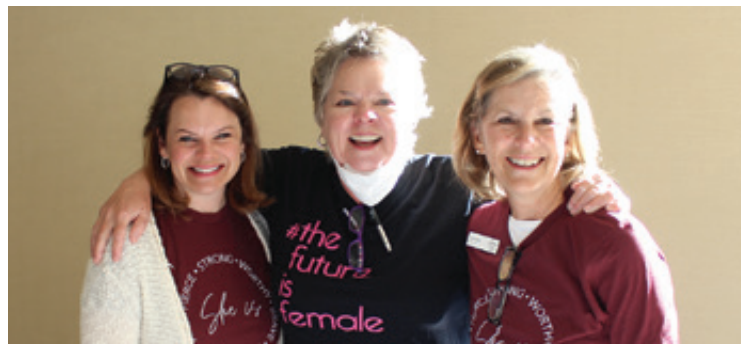
Teen Girls Go To College

The Schliemann Center for Women's Health is a vital part of Baxter Health's effort to provide excellent healthcare education for all women, whatever her age or role in life. We are here to support all women in becoming confident and educated in the areas of their health and assist them in making positive changes toward wellness. Call (870) 508-2345.