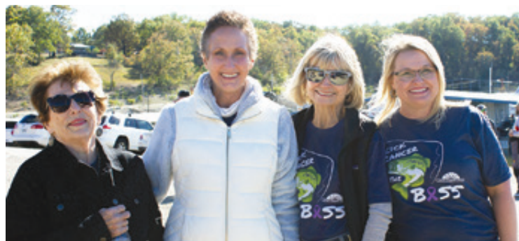
Kick Cancer in the Bass

The Peitz Cancer Support House is dedicated to helping anyone going through the cancer journey. You will find personalized support and group gatherings, information regarding diagnosis, treatment and survivorship. We provide care packages, wigs, hats, scarfs and mastectomy supplies. We're here to provide you with love, encouragement and hope - and make sure no one faces cancer alone. Call (870) 508-CARE (2273).